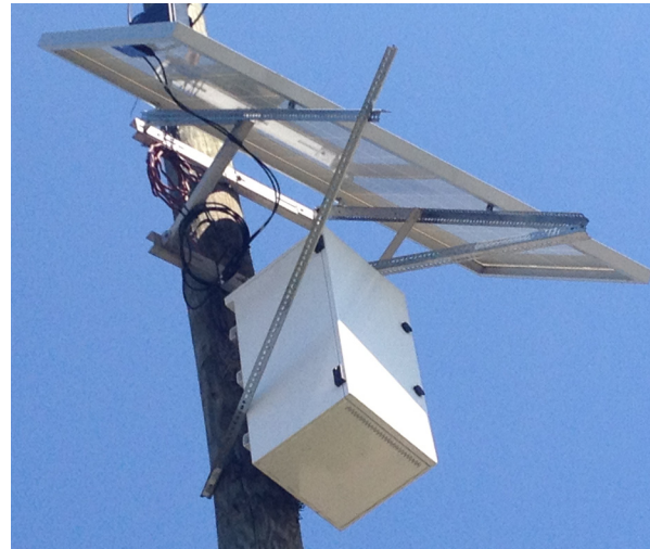
Solar panel for power and meshing for connectivity in remote areas of yard without Ethernet or power

After initial problems with Wi-Fi connectivity, Kampwerth said they were thinking about installing fiber throughout the yard to implement their tracking systems, but after Rustad recommended trying Ruckus ZoneFlex access points, they scrapped the idea. "When we tried the Ruckus systems, the Wi-Fi was just bulletproof," said