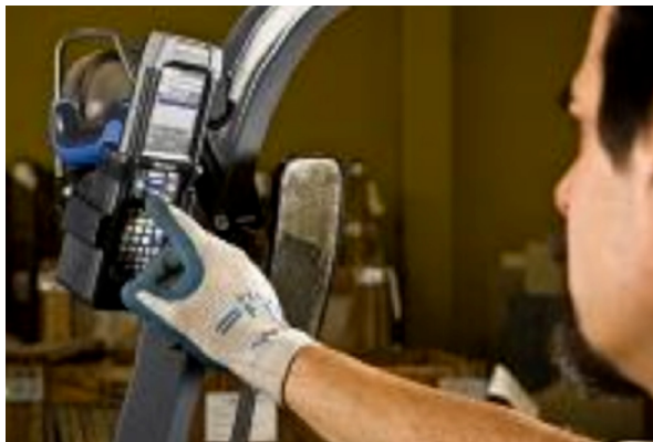
Intermec supply chain handheld devices required Ruckus BeamFlex Adaptive Antenna Technology for reliable connectivity over vast area

and experts at deploying inventory control solutions. “Success or failure of this type of inventory control system throughout such a widespread area completely depends on the quality of the Wi-Fi signal.” Said Rustad. “Further, Cisco’s mesh didn’t work and this was a key requirement to enable wide spread connectivity throughout the yard without spending an exorbitant amount of money to wire hundreds of acres of land.”